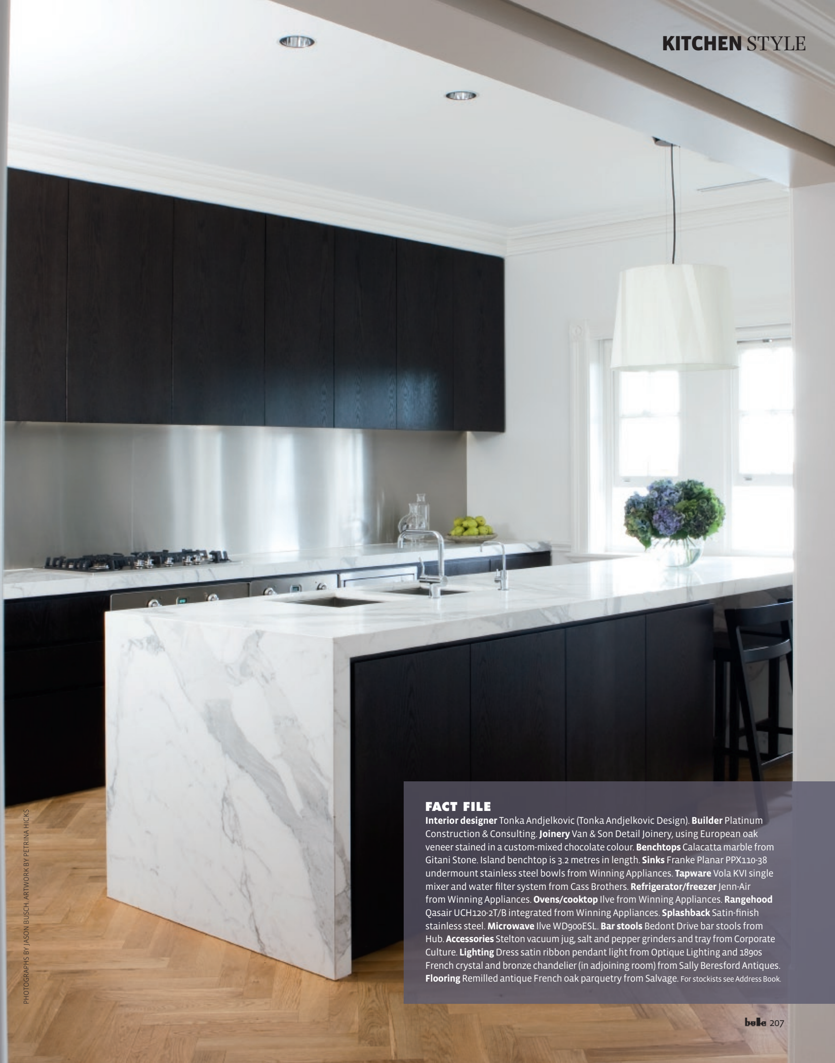
PHOTOGRAPHS BY JASON BUSCH, ARTWORK BY PETRINA HICKS

INTERIOR DESIGNER TONKA ANDJELKOVIC “I wanted to create a contemporary, elegant space with clean lines but also to evoke the spirit of a classic Parisian apartment, so I added ornate cornices, architraves around the windows, and plaster details to the walls. The island benchtop is in one piece of marble that had to be brought in from the street by crane.”